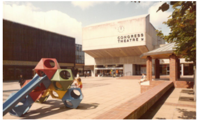
D2603/A/C/3485 Shopping in the town centre Congress Theatre, Gwent Square D6203/A/C/3363)

Information about everyday life can be found in the following records: