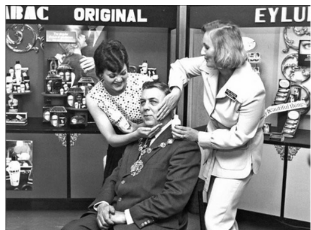
Employees at Eyclure, with the Mayor D2603/C/3373

Employment opportunities were available before the development of the New Town in Cwmbran, but the new development brought even more industry to the area – including some very well-known companies.