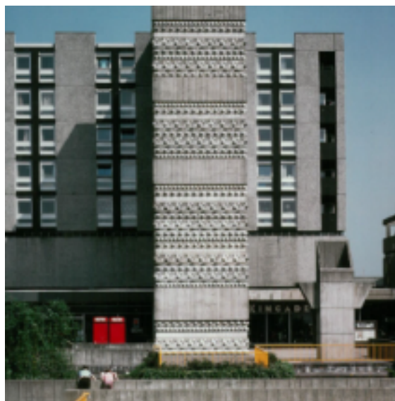
Left: D2603/A/C/3372 Aerial Photograph, Cwmbran Right: Monmouth House, D6203/A/C/3366