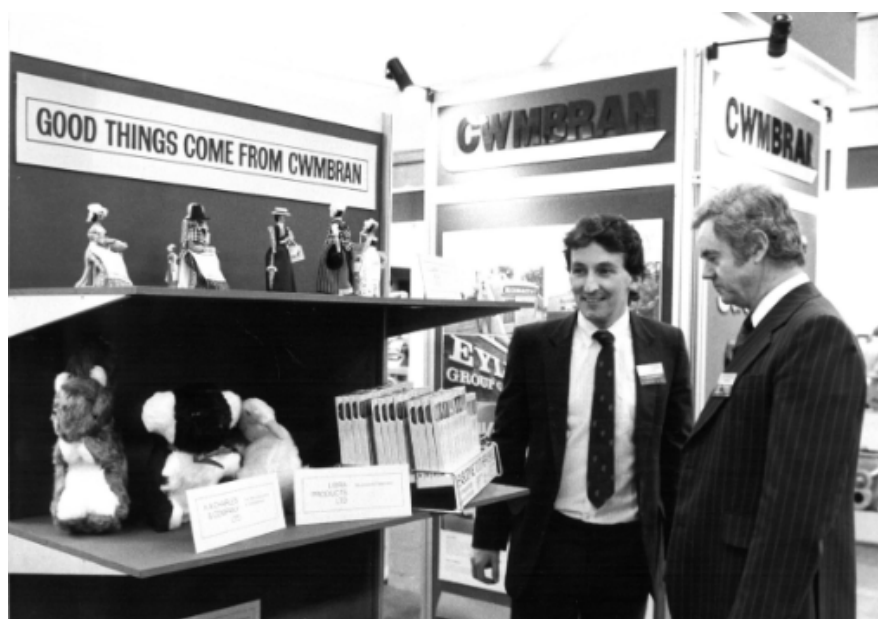
'Good Things Come to Cwmbran' (D2603/A/C/3365)

We hold an excellent set of photographs for an exhibition called 'Good Things Come to Cwmbran' which showcase the different businesses in Cwmbran.